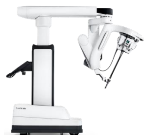
Da Vinci SP (Single-Port) surgical system