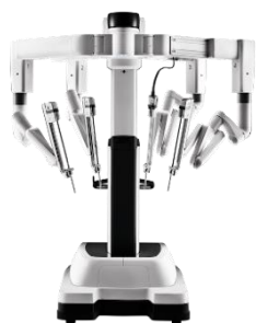
Da Vinci Xi surgical system

a surgeon starts a procedure using a da Vinci surgical system