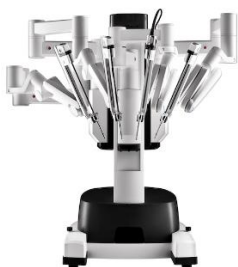
Da Vinci X surgical system