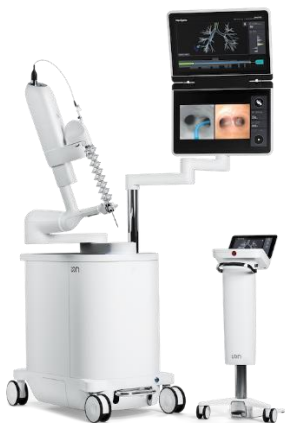
Ion endoluminal platform

We continue to collect clinical data through ongoing clinical studies in hospitals throughout the United States. These studies may provide us with additional insights as to how Ion can further assist physicians in achieving lung nodule biopsies.