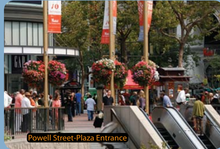
Powell Street-Plaza Entrance

The AirBART shuttle departs every 15 minutes from the 3rd curb across from the terminals. When you get off the shuttle at the Coliseum BART station, buy a round trip BART ticket from the ticket machine. Take the escalator up to the westbound platform and board a San Francisco or Daly City bound train. The BART trip to San Francisco takes about 20 minutes.