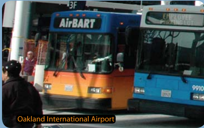
Oakland International Airport

The BART station is located in the SFO International Terminal. It's only a five minute walk from Terminal Three and a 10 minute walk from Terminal One. Both terminals have connecting walkways to the International Terminal. You can also take the free SFO Airtrain to the BART station.